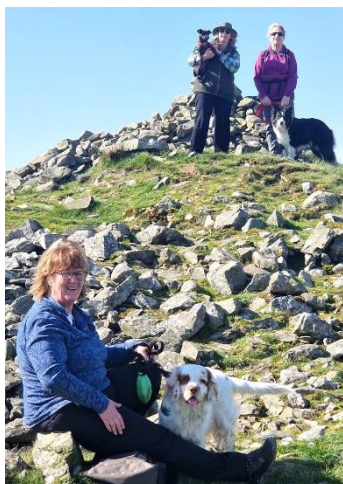
The Backpack Dogwalkers reached the top of Caer Drewyn above Corwen.

Gan gychwyn ar ddiwrnod heulog godidog, fe gychwynnon ni ar ein taith gerdded o Faes Parcio Corwen ar gyfer ein taith gerdded ym mis Mawrth. Aeth y daith gerdded hawdd i gymedrol â ni ar hyd yr hen drac rheilffordd a'r lonydd i gopa hen gaer fryn Corwen, Caer Drewyn. Cawsom olygfeydd 360 gradd ysblennydd am filltiroedd ac roedd yn werth y ddringo ar ddiwrnod clir. Roedd y cŵn wedi blino'n lân pan gyrhaeddod ni uchafbwynt ein taith gerdded, a ddilynwyd gan fwyd a lluniaeth yng nghaffi 'Yum Yum's'. Rhoddir clod i'r holl gŵn a oedd yn ymddwyn yn eithriadol o dda. Byddai Meggie yn dweud, "Oedden fe roedden ni, er ein bod ni'n cael ein poenydio gan arogl deniadol bacwn a selsig; cael ein clymu wrth goes bwrdd a disgwyl iddyn nhw eistedd yn llonydd!" Rhaid sôn am Alma a Buddy sydd bellach yn ôl ar y bwrdd ac yn gallu ymuno â ni eto ar gyfer cerdded ac