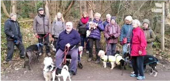
A previous canine stroll at Loggerheads Country Park.