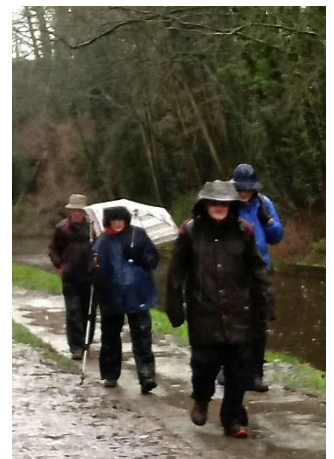
February fill-dyke weather accompanied the walk along the Llangollen canal.

The February low level walk from Llangollen to Pontcysyllte proved to be a popular one, despite the poor weather. Well, it was Friday 13th! Twenty one of us walked the 4.7 miles along the canal towpath, passing by impressive views of the Dee in full flow at the start. We saw lots of snowdrops and, amazingly for the time of year, some cowslips. The walk was enlivened by a cryptic quiz, the answers to which were all names of narrowboats moored