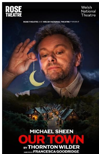
Several members travelled to see the National Theatre of Wales production of Our Town