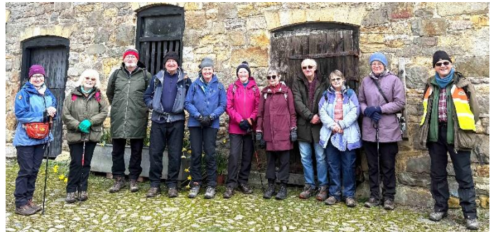
Inside Chirk Castle.