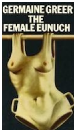
Was feminism let down by Germaine Greer?

Y syniad mawr y mis diwethaf oedd Ffeministiaeth, ac roedd gennym raniad cyfartal o rywiau gyda phedwar ar bob ochr, ond wyth personoliaeth wahanol yn gwrthsefyll stereoteipio'n weithredol. Yn unol â hynny, nid oedd unfrydedd llwyr ynghylch a oedd Ffeministiaeth yn syniad da neu a gollodd ei ffordd rywle rhwng Wollstonecraft a de Beauvoir - i gael ei siomi gan weithgareddau Germaine Greer. Ar y llaw arall, credwyd bod benyweidd-dra yn dal i oroesi fel elfen hanfodol o'r diwydiannau harddwch a hysbysebu. A yw agor y farchnad ar gyfer persawr a llawdriniaeth blastig Dynion yn golygu bod cydraddoldeb wedi'i gyflawni? Ni chafodd y patriarchaeth hanesyddol ei chondemnio'n gyffredinol, fel y gellid bod wedi'i ddisgwyl efallai, gyda rhai pwyntiau ynghylch sefydlogrwydd cymdeithasol a diogelwch y cyhoedd yn cael eu gwneud yn dda. Archwiliwyd dioddefaint a dewisiadau bywyd amheus ynghyd â dylanwad cynyddol pornograffi a phuteindra. Awgrymodd un llais perswadiol mai gofynion Ffeministiaeth, a gymerwyd dros ddegawdau gan y nifer o ryddfrydwyr cymdeithasol â bwriadau da sy'n dominyddu ein sefydliadau, oedd yn gyfrifol am y radd bresennol o anhrefn. Roedd cryn dipyn o realaeth fiolegol, fodd bynnag, a mwy nag