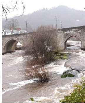
Heavy rains meant the River Dee was in full flow.