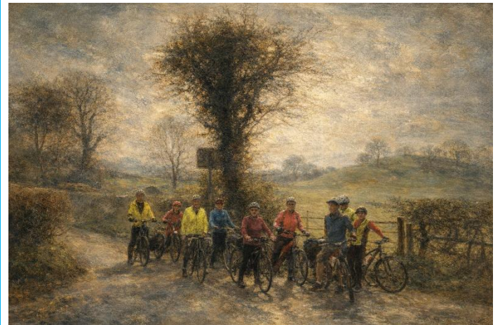
Straight out of a painting by J.M.W. Turner, the riders pause in the bucolic landscape.

Hurrah! The March cycle ride took place in bright sunshine. It was cool to start with in Ruthin but soon warmed up, especially as we climbed the 'Shelf' towards Llandegla. There were ten of us in total on the ride. We turned right at the end of the Shelf to cross the A525 and head out to Dafarn Dywyrch where we turned right to follow the lane past the glider club. Further on we turned left to pass Graig Escapes and then right onto a very bumpy lane leading to the road to Llyfasi. A left turn before Llyfasi brought us out on the A525 a few yards from Llanbenwch which was our lunch stop. The route back took us via Pentre Celyn and Graigfechan. It was 20 miles of lovely sunshine with splendid views and lanes full of spring flowers. Who could want more?