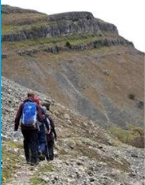
The route took the group past the Berwyn Slate Quarry and down to Oernant.