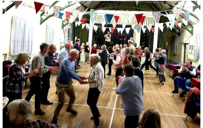
The ceilidh band 'Mooncoin' provided the music to the Friday night dance.

Sixty u3a members attended a very successful fundraising Ceilidh at Neuadd Eleanor village hall in Llanfair D. C. on Friday 20 th March. The first dance saw everyone up dancing to the excellent group Mooncoin and their caller. The evening continued with the dance floor full of enthusiastic dancers.