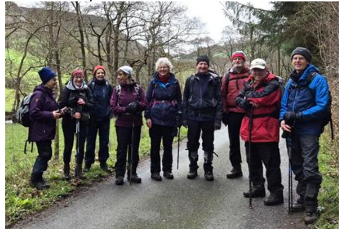
Pausing for a group portrait after reaching a minor road.